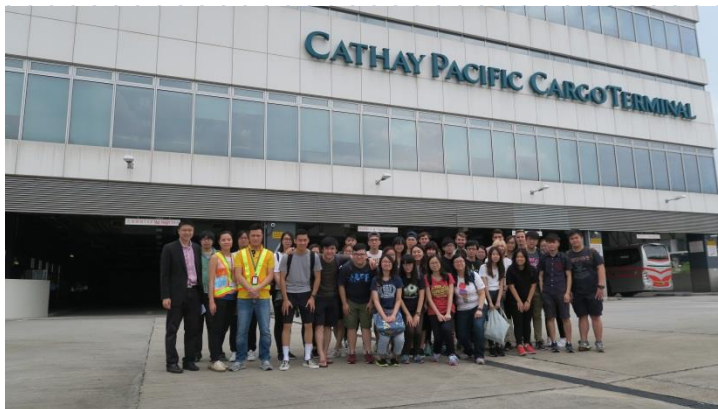
A group photo was taken outside the Cathay Pacific Cargo Terminal . 同學們於國泰貨運站外合照

修讀航運及運輸物流課程(SCM4202)同學於2016年10月7日往國泰貨運站作實地參觀。