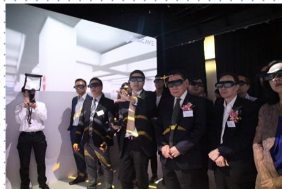
Guests experienced the VR CAVE system of the Centre 嘉賓體驗中心的虛擬實境系統