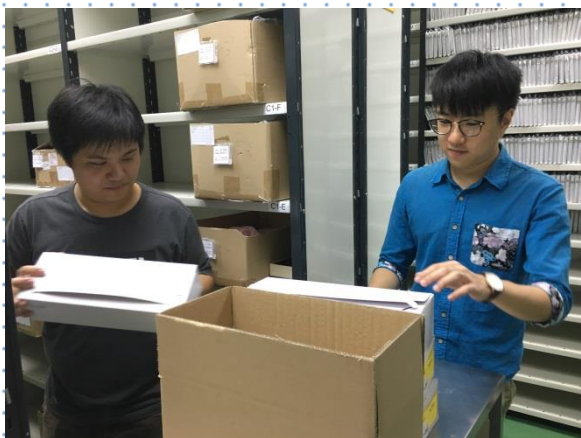
Our students showed huge enthusiasm in doing a variety of jobs. 同學們都很用心和積極去處理不同類型的工作

供應鏈管理學系同學今年有機會參與由施華洛世奇提供的實習訓練。同學藉此寶貴機會可以應用於課堂上學到與供應鏈有關的知識，更重要的是他們可以親身體會和吸收職場上的工作經驗。施華洛世奇分銷中心主管對我系同學的工作表現亦非常滿意，覺得同學們都很用心和積極去處理不同類型的工作。