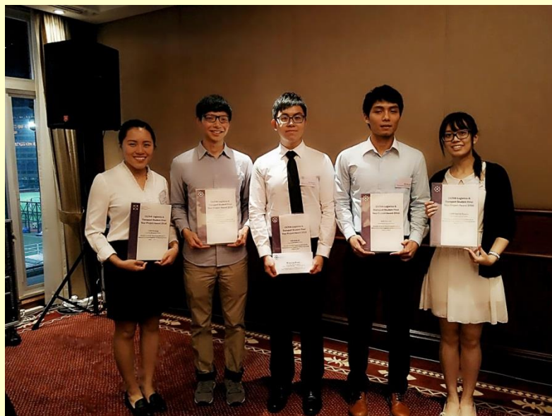
Group photo of the Final Year Projects winning team 畢業論文比賽得獎者合照

頒獎典禮於9月20日香港運輸物流協會周年大會假足球會舉行。所有獲獎者均獲邀出席。