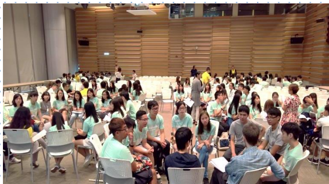
Group discussion with personal tutors 與個人導師的小組討論時間