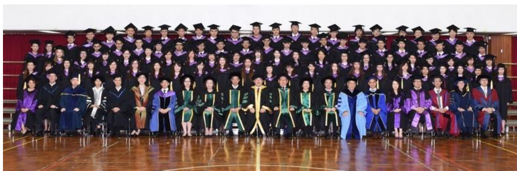
2016 Graduating Class of Bachelor of Business Administration in Supply Chain Management (BBA-SCM) 供應鏈管理工商管理學士課程的2016年度準畢業班