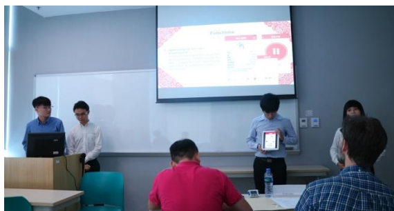
Participants were demonstrating some of the functions of the mobile phone application they have designed to the judging panel 參賽隊員向評判示範他們所設計的手機應用程式的部分功能