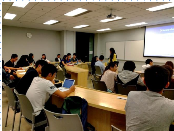
Lively discussion among student participants during the seminar 參加者在研討會期間熱烈討論