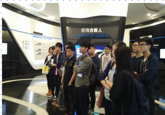
Scene during the visit at QianHai Bonded Bay Port and QianHai E-Hub