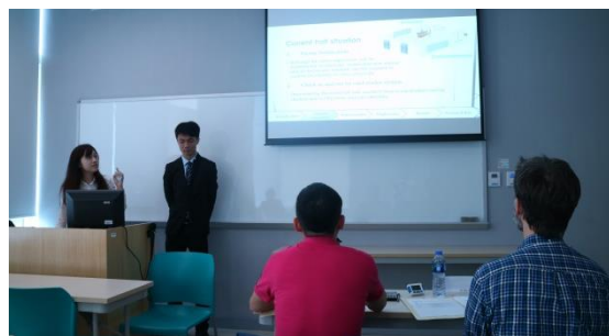
Participants were introducing the main idea of the mobile phone application they have designed to the judging panel 參賽隊員向評判介紹他們所設計的手機應用程式的設計概念