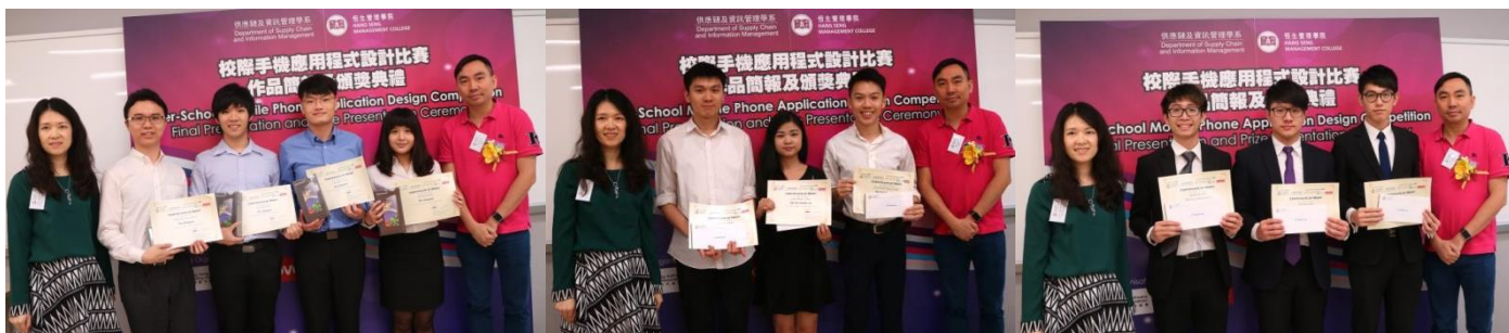
The Champion Team 冠軍組別合照 Each team member was awarded a tablet sponsored by Lenovo (HK) Ltd. 各隊員均獲贈由聯想(香港)有限公司贊助的平板手機乙部

冠軍組別同學分別來自香港科技大學及恒生管理學院。他們於頒獎典禮後的訪問環節中指出：「有鑑於香港社會人口逐漸老化，我們決定為一眾喜愛粵劇的退休長者設計出以「粵曲風」為題材的手機應用程式。我們的目標是希望透過手機應用程式，為退休長者建立有意義的退休生活，並且為他們創造一個新的社交群組，以及保護粵劇的歷史及文化遺產。」此外，他們的設計還有照顧到長者用家的需求，如：選用較大的字型和按鈕，不需要輸入登入密碼等。其中的功能包括最新粵劇活動和消息公佈，粵劇課程以及邀請志同道合的朋友作夥伴等。