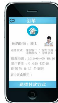
Mobile APP "屋「煮」" designed by the 2 nd Runner-up Team 季軍組別所設計的手機應用程式