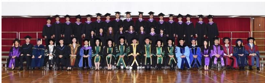
2016 Graduating Class of Bachelor of Management Science and Information Management (BMSIM) 管理科學與資訊管理學士課程的2016年度準畢業班