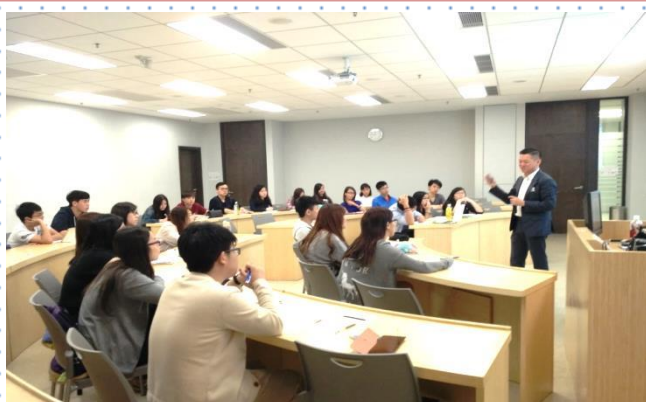
Scenes of the seminar. 研討會現場

APP不僅為參加者提供了航空業的知識，並促進他們提升商業顧問的技能，以走上成功的職業道路。計劃期間，來自不同公司的專家提供的實地考察和研討會為他們提供寶貴的學習機會，有助於擴大他們的視野。在整個計劃中，參加者將獲得航空業的專業知識和技能，使他們對企業的運作有更深入的了解，為未來在航空業界的職業生涯作規劃。