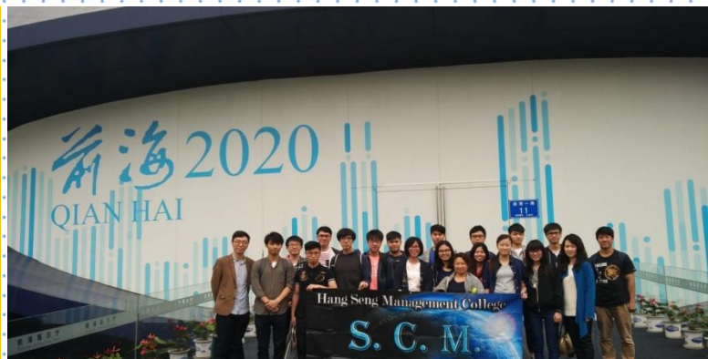
A group photo of student participants and Teachers in-charge of SCM Department was taken at QianHai.

前海是深港現代服務業合作區。這項創新的合作機制進一步深化深港的緊密合作。香港特區政府亦在廣東「十三五」規劃建議中提出，重點推進各種粵港澳及前海的平台。參加者在考察當天參觀了前海展示廳、前海灣保稅港區及前海深港現代服務業合作區，親身體驗當地投資營商環境。是次實地考察活動能順利舉行，有賴於前海國際聯絡服務有限公司的悉心安排及深圳保宏電子商務綜合服務有限公司市場總監的詳盡講解。考察活動在一片互動中圓滿結束。