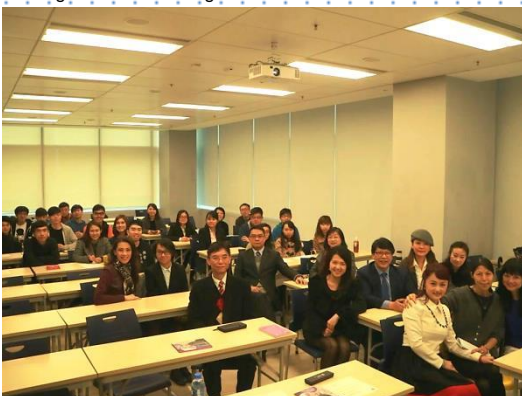
A group photo was took after the seminar on 24 March

The SCM Department and the Centre for Corporate Sustainability and Innovations (CCSI) organised a series of seminars entitled “Learning more on Entrepreneurial Spirit” starting from February to April 2016. This series is fully supported by HSMC’s Centre for Teaching and Learning (CTL) and United Nations Office for South-South Cooperation (UNOSSC), US.