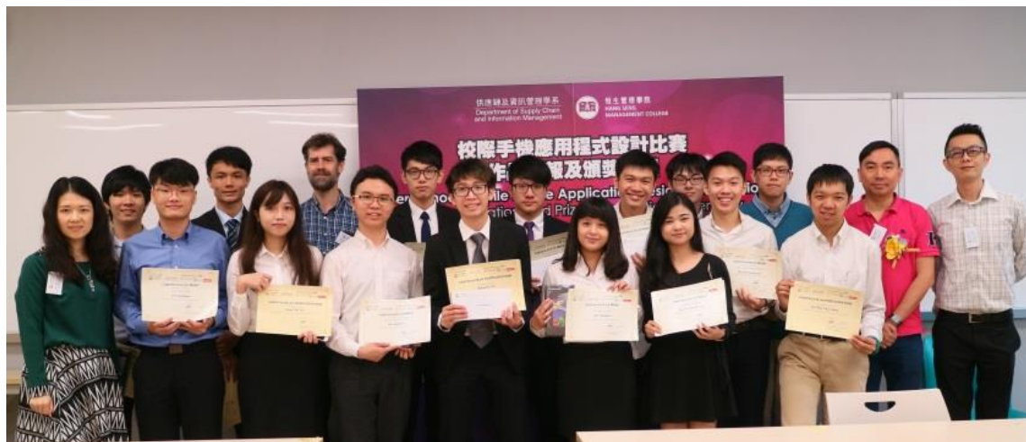
Group photo of all participating teams 所有參賽組別合照留念