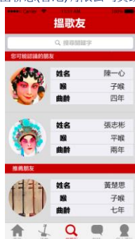
Mobile APP "粵曲風" designed by the Champion Team 冠軍組別所設計的手機應用程式