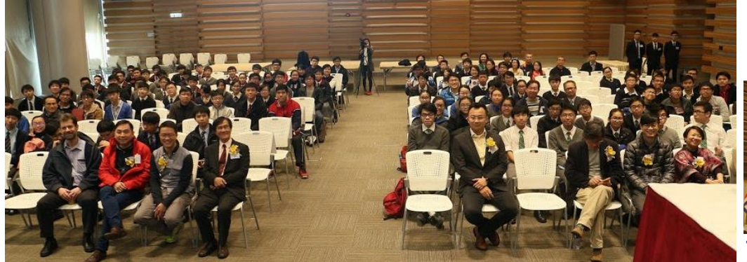
Gathered over 100 guests, judges, faculty members, secondary school teachers, participated students and their parents at the ceremony