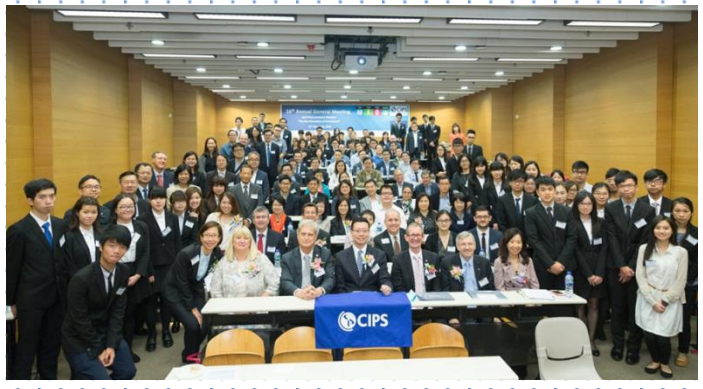
A group photo was taken after the ceremony with all the guests and students