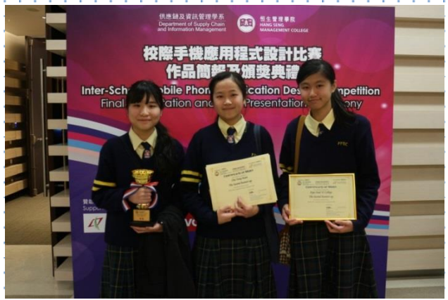
2nd Runner-up Team 季軍組別合照 Each team member was awarded shopping vouchers sponsored by Hong Kong Software Industry Association 各隊員均獲贈由香港軟件行業協會贊助的超市購物禮券