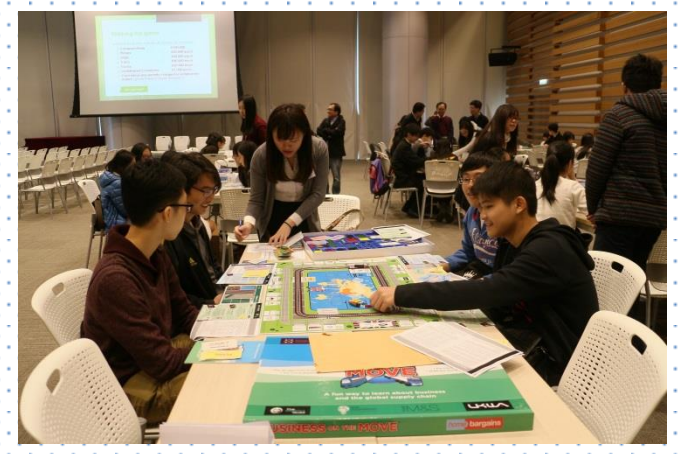
Students were arranged in groups and enjoyed playing the logistics board game 同學分組進行棋盤遊戲