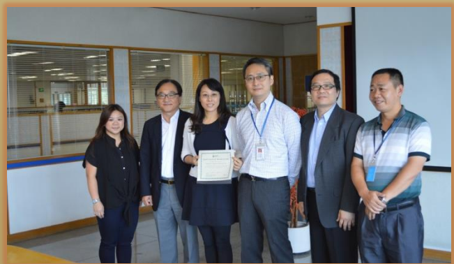
SCM colleagues presented the Certificate of Appreciation to the Representatives of Kingboard Chemical Holdings on 8 October 2014