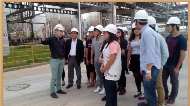
Representative from Huizhou Zhongxin Chemical Industry Limited Company introducing their facilities and latest technologies to enhance production efficiency

惠州忠信化工有限公司的代表為同學們介紹生產上所應用的設施和最新的科技，以提升生產效率