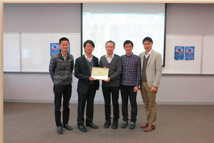
SCM colleagues presented the Certificate of Appreciation to the guest speaker on 24 January 2015