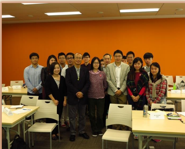
Group photo of guest speakers, SCM colleagues and participated students after the Workshop on 15 November 2014

參與工作坊的項目團隊包括來自恒生管理學院四年級的學生、公司的代表和香港貨運物流業協會會員。此次工作坊將提升參與者對於ISO14064，全球永續性報告書組織（Global Reporting Initiative, GRI），環境、社會與管治（Environmental, Social and Governance, ESG）有更深層次的理解，並且培訓參與者量化計算第三方物流營運的碳排放。