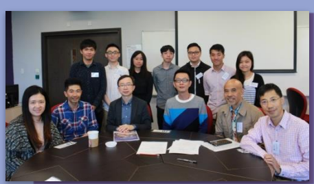
Group Photo of mentors and mentees 各業界專業顧問與學生合照