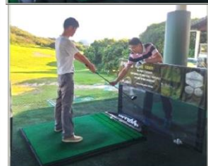
Our academic staff members played golf at the driving range 一眾教職員在練習場打高爾夫球