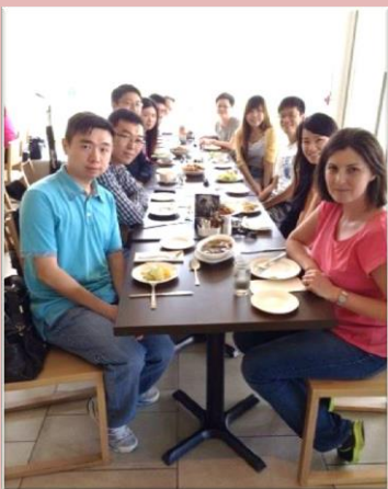
Our department staff enjoyed lunch at Coffee Shop with the beautiful landscape