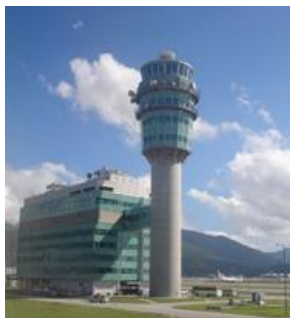
Air Traffic Control Tower.

供應鏈管理學系黃彥璋博士與四年級同學於四月份往民航處及香港國際機場航空交通管制大樓參觀。同學於是次參觀吸取了不少航空交通管制及運作系統的新知識，有職員助他們預備畢業論文。在此向當日為我們分享經驗及負責帶領參觀的各代表致意。