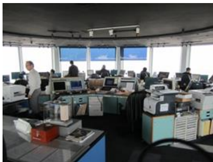
A View of the Air Traffic Control Centre.