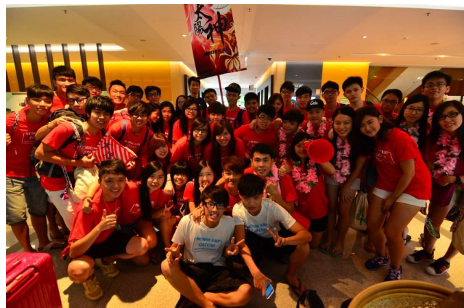
Students took group photos after the orientation activities (upper, upper-left & bottom-left). 同學於迎新活動後拍攝團體合照 (圖上、左上及左下)。