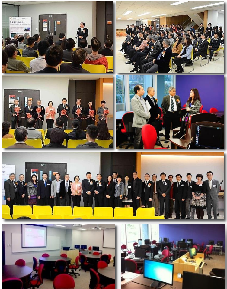
決策科學科技實驗室一角 Views of the Laboratory

Scenes from the Opening Ceremony of the DST Laboratory