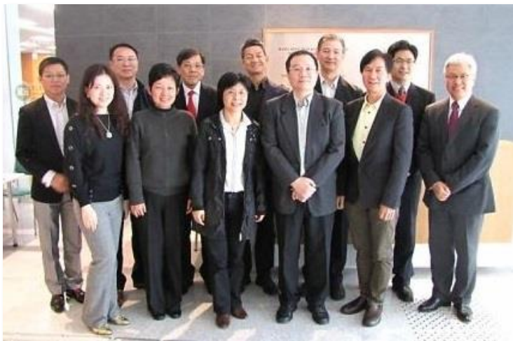
出席「師友學習」的業界代表與統籌導師於學院拍照留念。 A memorable snapshot with Industry Advisors and Mentorship coordinators at the campus.