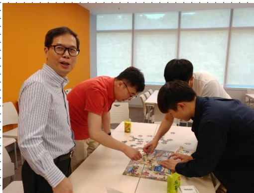
The mentors and mentees enjoyed the ice breaker game. 導師和學員於破冰遊戲打成一片。