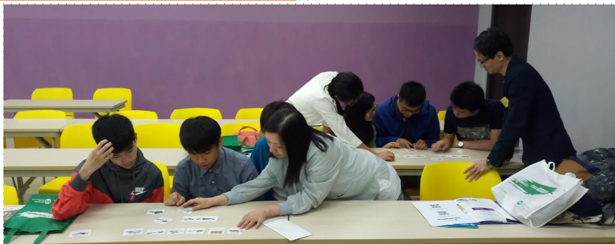
Students participated the games in the seminar. 參加講座的學生投入參與遊戲。