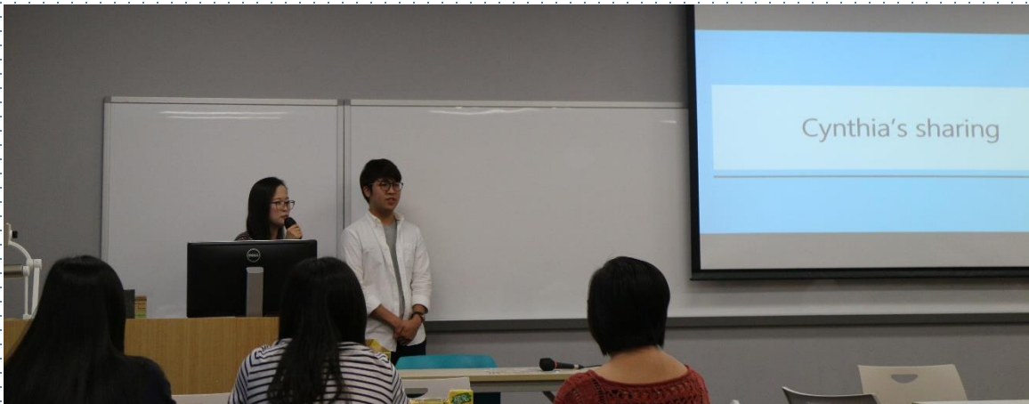
Mentees of Mentorship Scheme 2016/17 shared how the scheme had facilitated their personal growth. 上年度師友交流計劃學員分享計劃如何促進個人成長。