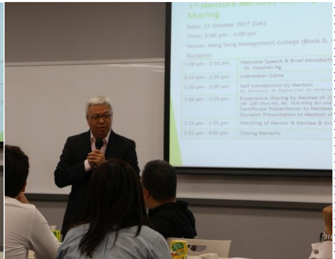
The mentors introduced themselves. 導師自我介紹。