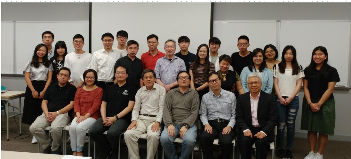
Group Photo of Mentors, Mentees and Academic Staff 師友交流計劃學員、導師及供應鏈及資訊管理學系教職員合照