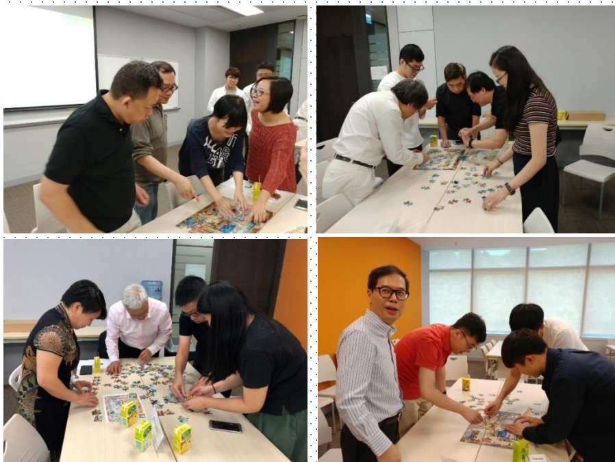
The mentors and mentees enjoyed the ice breaker game. 導師和學員於破冰遊戲打成一片。