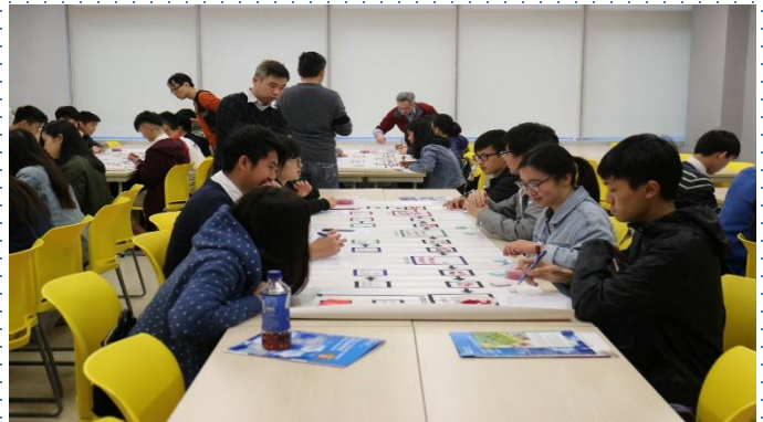
Participants enjoyed the game 參加者享受遊戲並樂在其中