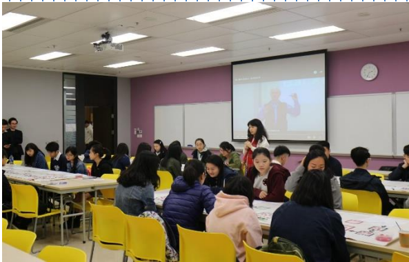
The instruction of the Beer Game was given by our academic team 參加者細心聆聽遊戲內容