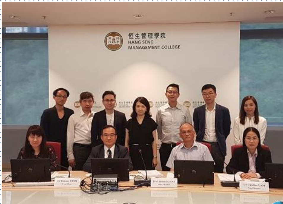
Independent Re-accreditation Panel members with the programme Team 獨立覆審小組與課程團隊

管理科學與資訊管理(榮譽)學士課程於2018年7月10日進行了獨立覆審，收集專業意見，讓課程力臻完善。香港學術及職業資歷評審局將於2019年1月16日至18日進行實地考察。