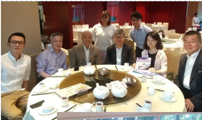
The academic staff, the members of BMSIM Programme Advisory Committee and student representatives 管理科學與資訊管理課程顧問委員會成員與教授及學生代表

管理科學與資訊管理(榮譽)學士課程及供應鏈管理工商管理(榮譽)學士課程的顧問委員會會議分別於5月28日及8月29日舉行，一年一度的顧問委員會會議提供了一個重要的平台，用於討論課程的發展和讓學生、學者及商界專業人士交流。