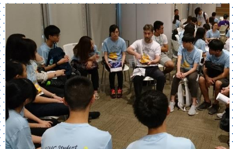
Department's Session on Orientation Day 2018 2018年供應鏈及資訊管理學系迎新日