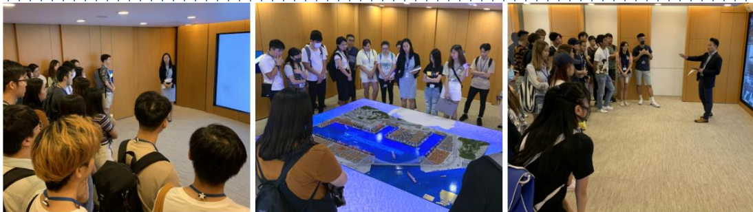
Representatives of HIT have shared the latest development of the port. HIT的代表向同學分享了港口的最新發展情況。

供應鏈及資訊管理學系在2019年10月8日（星期二）和2019年10月11日（星期五）為學生舉辦了參觀香港國際貨櫃碼頭有限公司（HIT）的活動。HIT是和記港口集團的港口之一，擁有全球港口和物流業務網絡。HIT的代表們向同學分享了港口的最新發展情況，並在簡介會之後帶領他們參觀了集裝箱堆場。活動總共有70名本學系同學參加，他們通過活動對供應鏈有更深入的認識。在活動結束時，本系教授向HIT的代表送上紀念品並拍照留念。