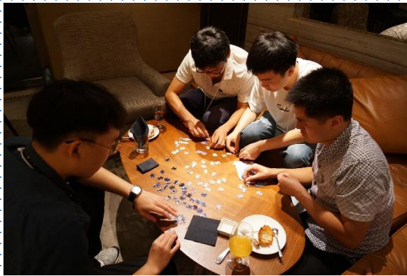
Ice-Breaking Game 破冰遊戲