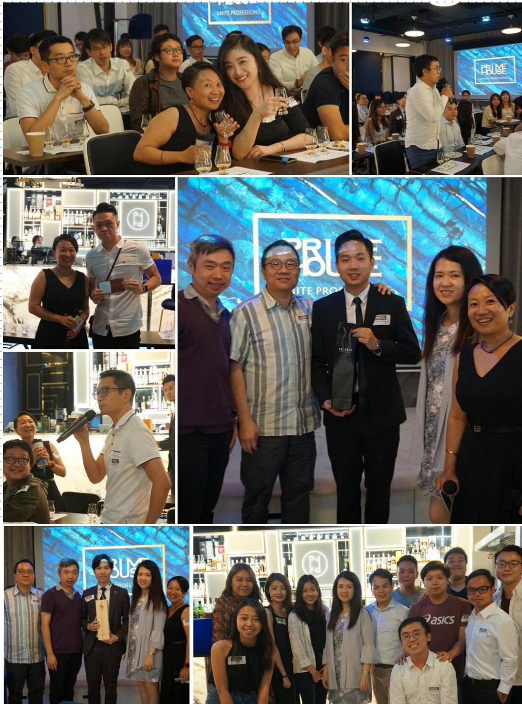
Precious moments during the event 活動期間的寶貴時刻