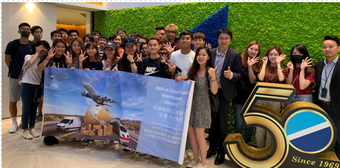
SCM academic staff and students took photo with the HIT representative. 本系教授、學生與HIT的代表合照