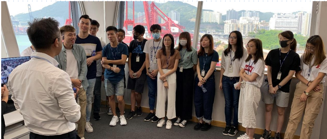
The representative of MTL shared the latest outlook of the industry. 碼頭代表分享了行業的最新前景

參觀現代貨箱碼頭活動於2019年10月10日舉行。現代貨箱碼頭現擁有及營運位於香港葵青港的貨箱碼頭，及其他地區碼頭，包括珠江三角洲（珠三角）大鰲灣碼頭、珠三角蛇口集裝箱碼頭及赤灣集裝箱碼頭。現代貨箱碼頭代表與學生分享了行業的最新前景以及現代貨箱碼頭的最新發展。然後，代表帶領學生參觀碼頭並討論了大灣區碼頭的未來發展。是次活動共有25名同學參與。活動結束時，本系教授向現代貨箱碼頭代表送上紀念品並拍照留念。