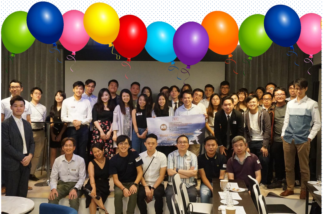
A group photo taken at the end of the event 活動大合照