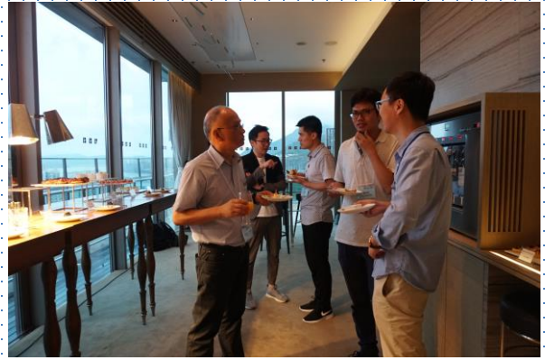
Everyone enjoyed the time. 來賓共聚聯誼