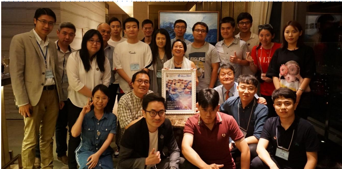
A group photo was taken at the end. 來賓大合照