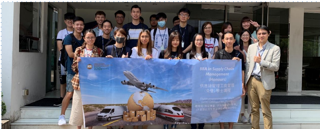
Group Photo 大合照