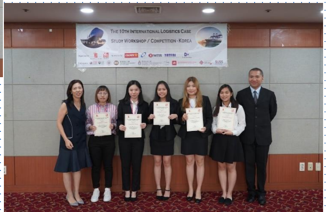
Group photo of the winning team 獲獎隊伍合照