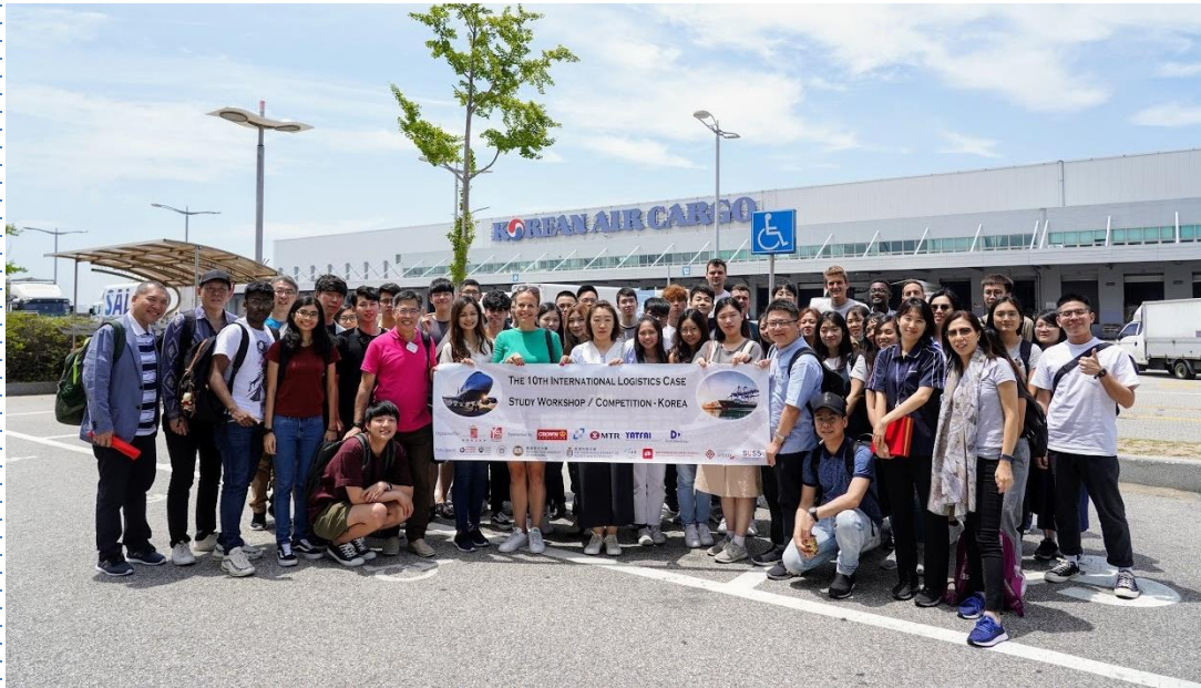
Visit to the Korean Air Cargo Terminal 參觀大韓航空空運貨站