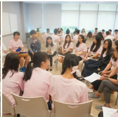
Newly admitted students and academic staff enjoyed the HSUHK Orientation Day 新生們及老師們投入參與迎新日