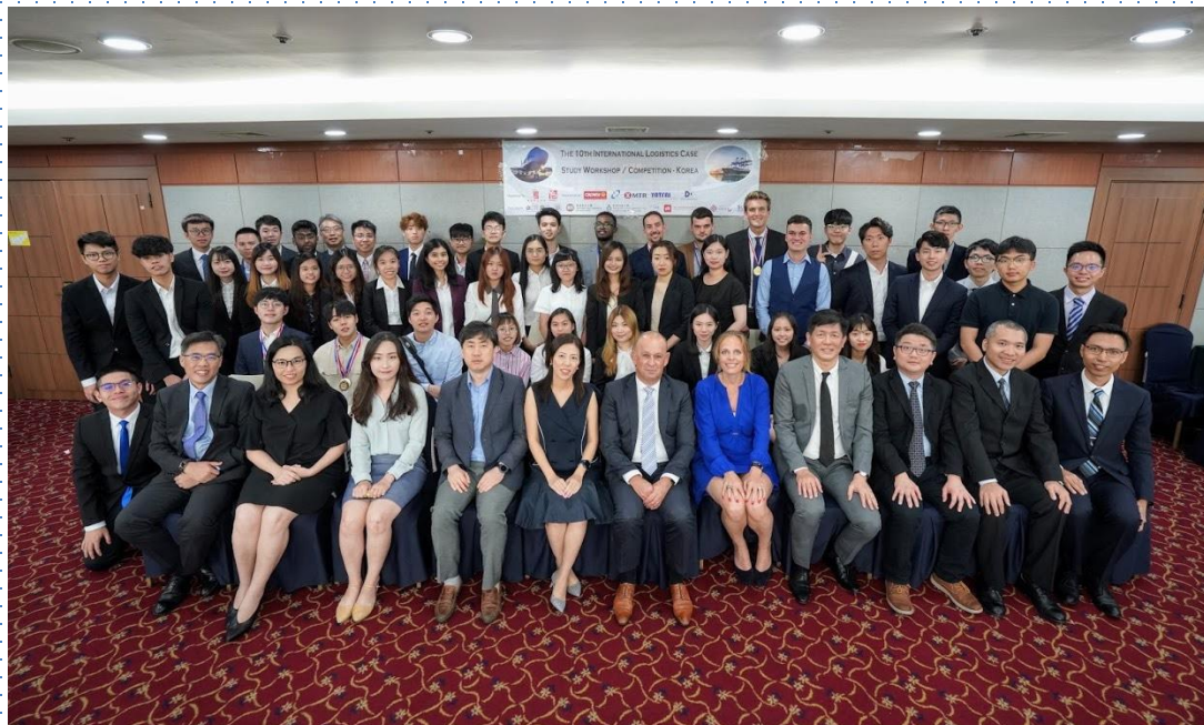
The participating teams pictured with representatives from the organiser in the 10th International Logistics Case Competition 2019 主辦單位代表與參賽隊員合照