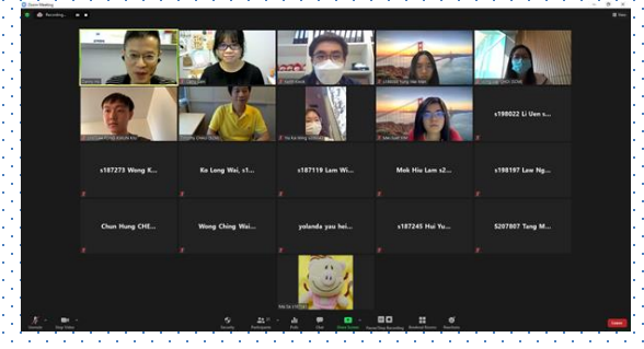
All participants enjoyed the event 所有參與者都很享受這次活動