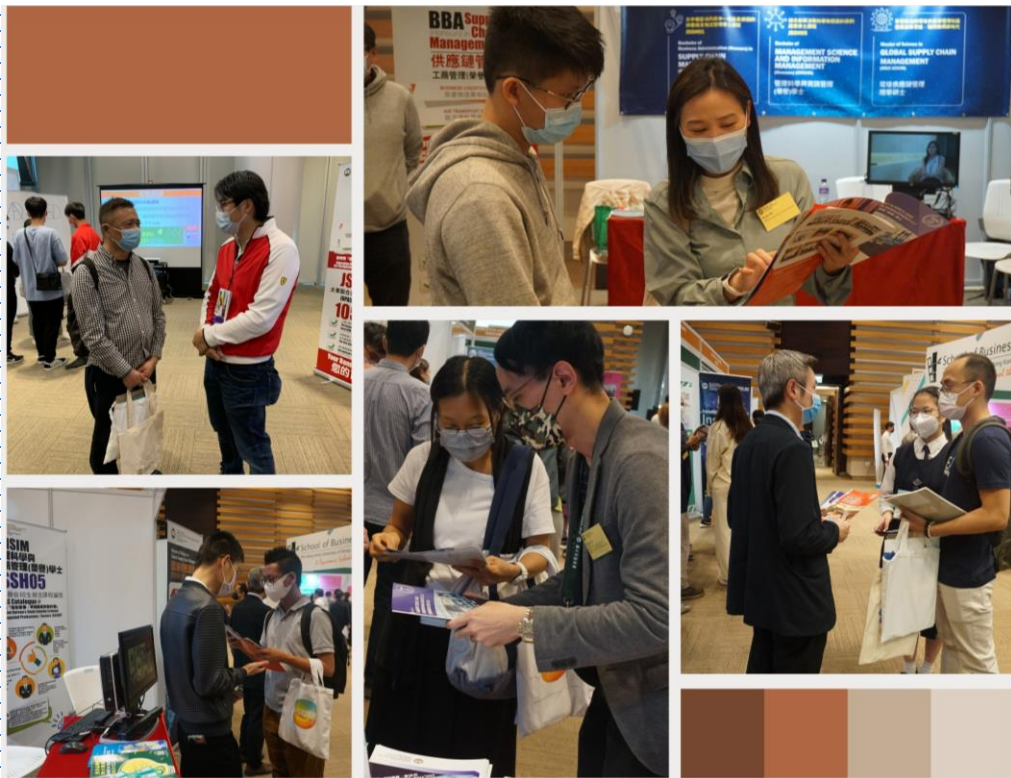
The academic team introduced programmes to prospective students and their parents 供應鏈及資訊管理學系教職員向學生及家長介紹課程

當日，供應鏈及資訊管理學系舉辦“未來供應鏈管理的新興技術”研討會。參與者了解了創新技術如何支持供應鏈管理。此外，我們的學術團隊和學生代表在展覽攤位與學生及其家長分享了我們課程的課程大綱、錄取程序、海外交流機會、實習機會及就業前景等資訊。