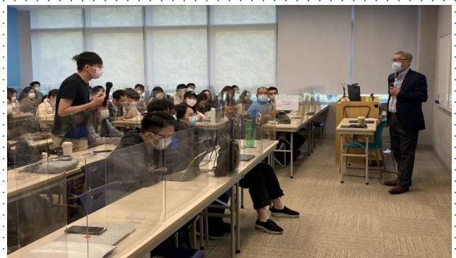
Students raised questions during the seminar. 學生於研討會期間踴躍發問