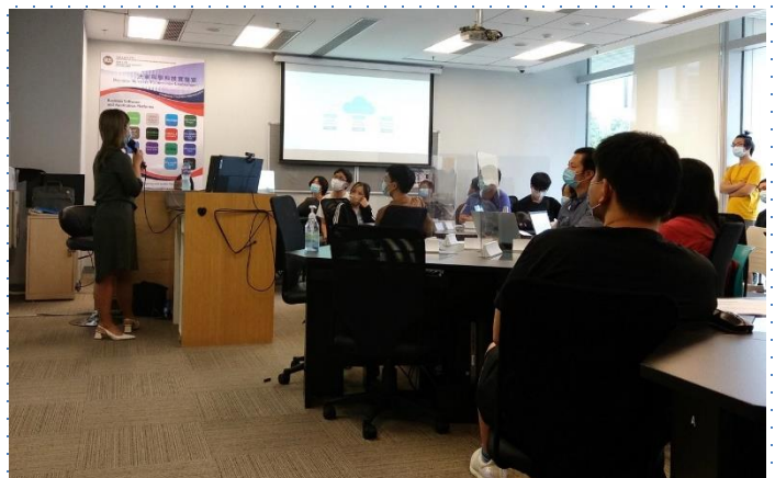
Over 20 students participated in the workshop. 超過20名學生參加了這次工作坊。