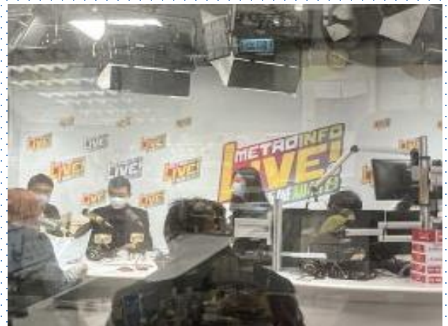
Live Radio Programme. 節目現場