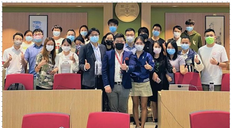
Group photo of on-site participants 現場參加者合照