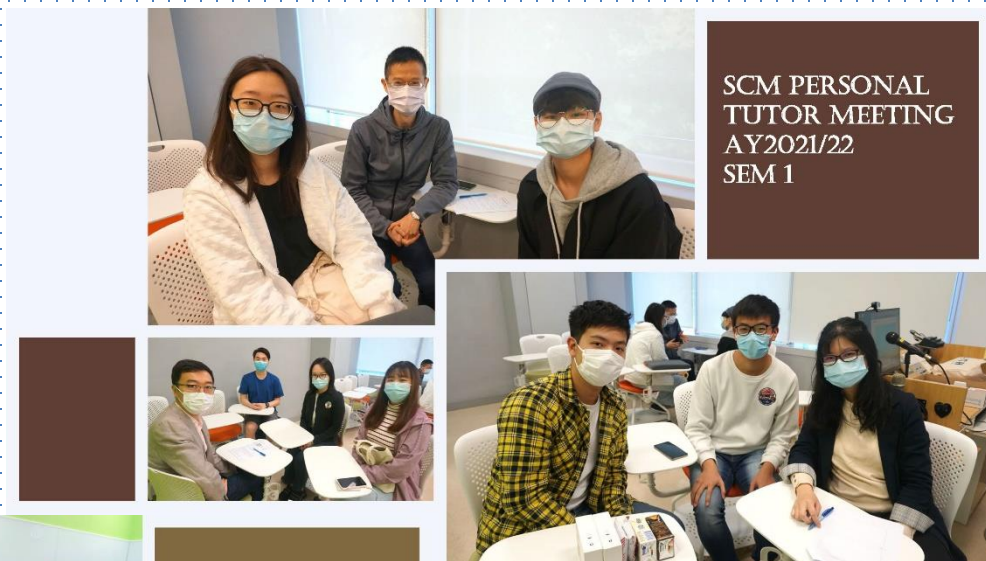
Personal tutors and their tutees 導師和學生合照

供應鏈及資訊管理學系定期組織個人導師會議，收集學生對校園生活和教與學的反饋。於2021年11月25日舉行了一次個人導師聚會，讓我們的教職員有機會傾聽學生的個人和學術需求，並提供適當的指導。大家當天都很投入傾談分享，度過了一個愉快的下午。