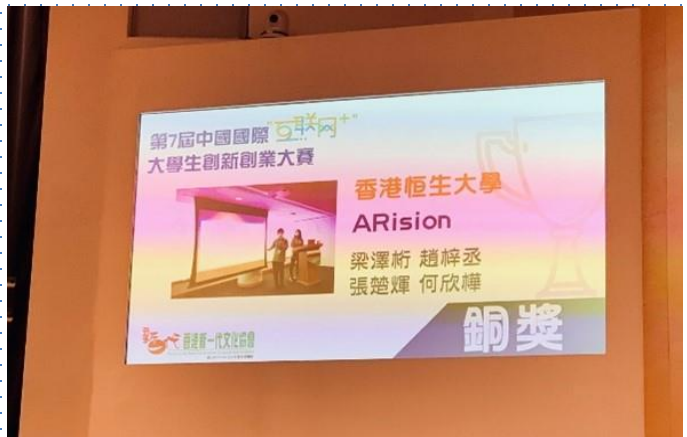
Photos taken in the award ceremony 頒獎典禮照片