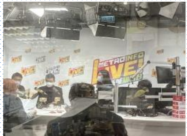
Live Radio Programme. 節目現場