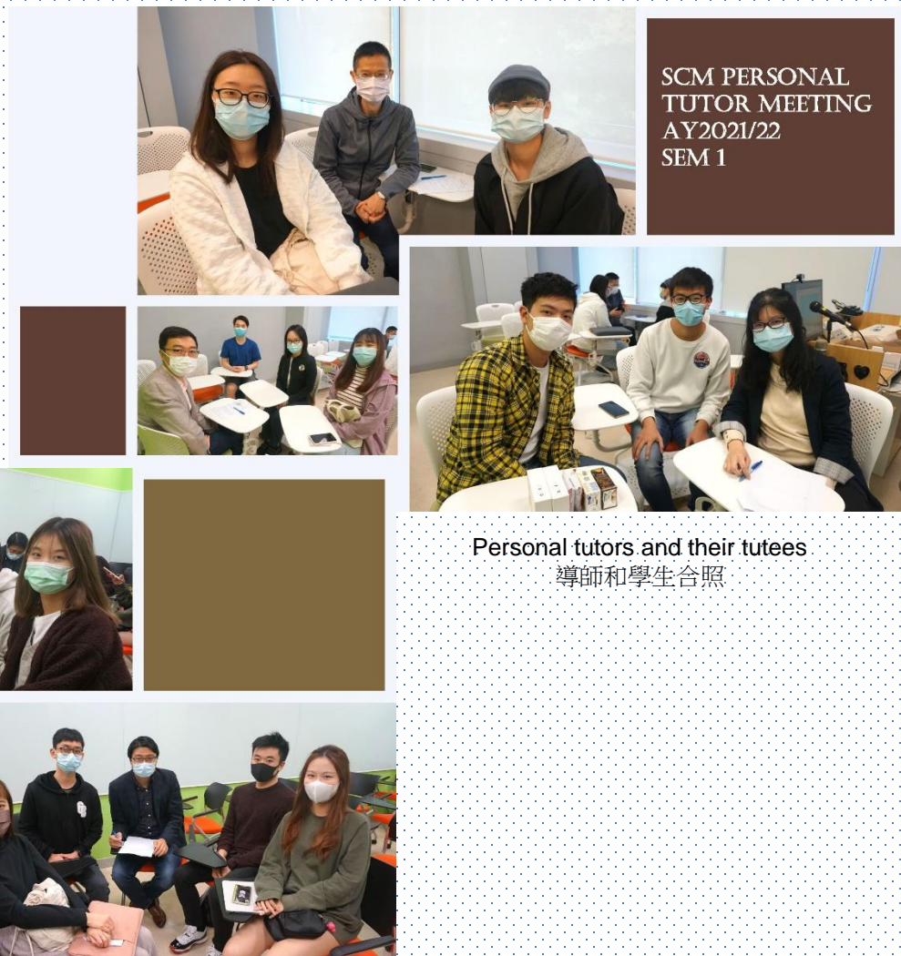
Personal tutors and their tutees 導師和學生合照

供應鏈及資訊管理學系定期組織個人導師會議，收集學生對校園生活和教與學的反饋。於2021年11月25日舉行了一次個人導師聚會，讓我們的教職員有機會傾聽學生的個人和學術需求，並提供適當的指導。大家當天都很投入傾談分享，度過了一個愉快的下午。