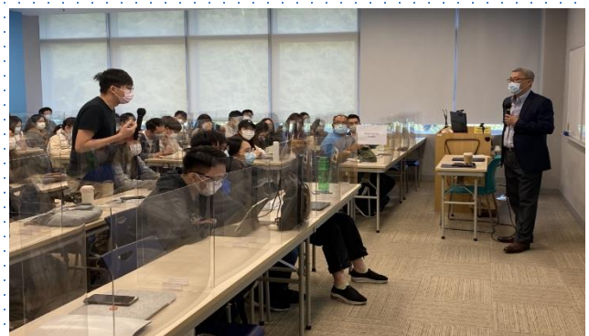
Students raised questions during the seminar. 學生於研討會期間踴躍發問