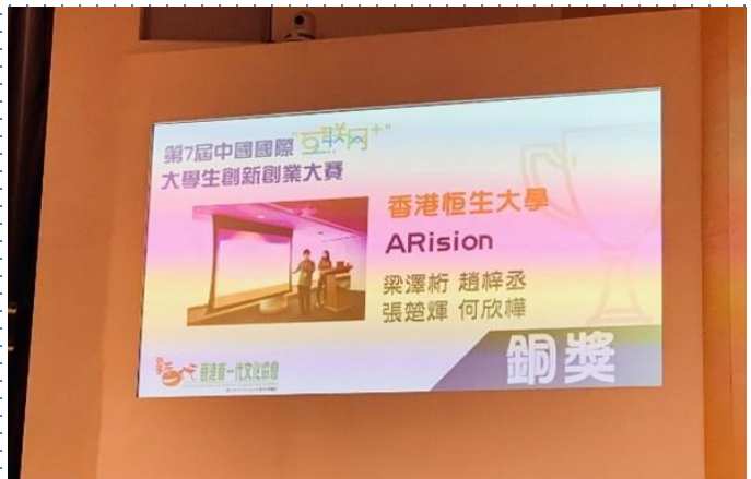
Photos taken in the award ceremony 頒獎典禮照片