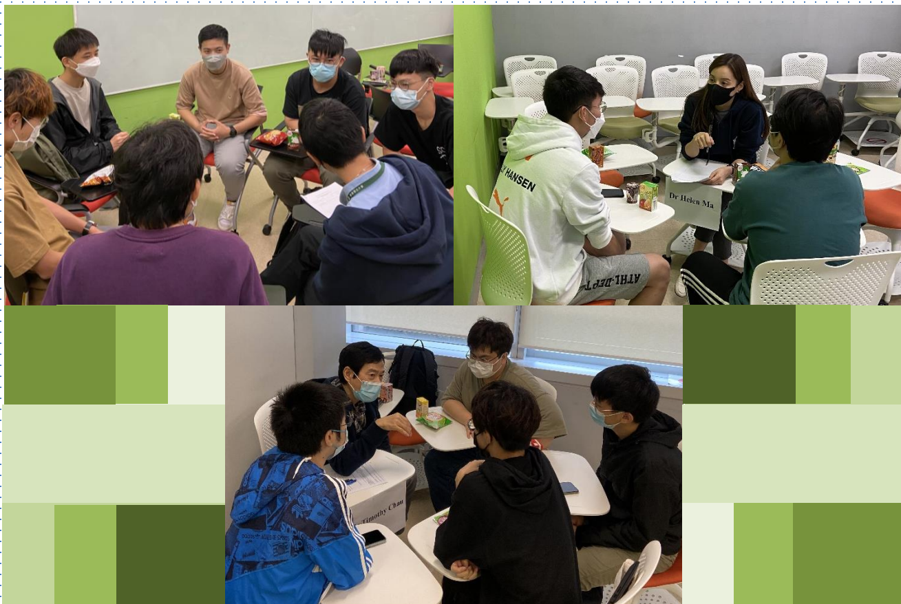
Students shared their views with personal tutors 參與同學與個人導師交流

參與的同學於聚會中以分組方式向個人導師們分享自己在學習及就業上的關注及計劃，導師們亦會作適當的回饋；一些高年級同學更與低年級同學分享自己的學習經驗。大家度過了一個既愉快又充實的下午。