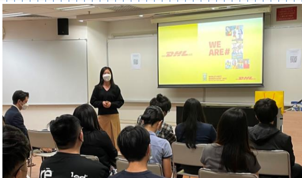
DHL HR representative shared the information of the Management Trainee Programme DHL人力資源管理代表分享計劃詳情

踏入問答環節，參加者向主講嘉賓踴躍提問，主講嘉賓與校友及學生互相交流。是次分享令學生更了解物流業的最新資訊，機遇和發展。