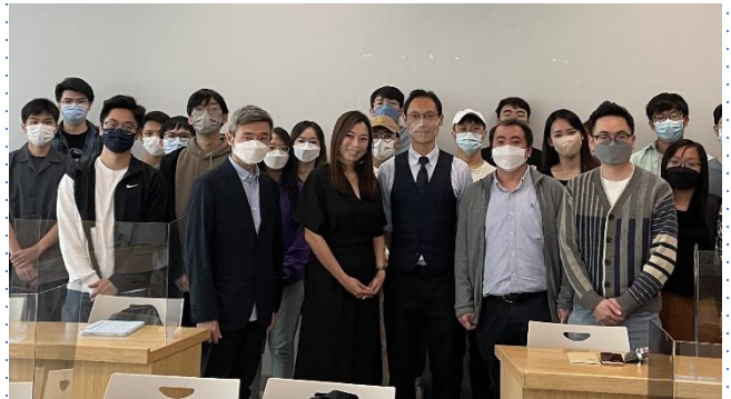
Group photo of DHL HR Professions, instructors and participating students 主講嘉賓、學系教授及參與學生大合照