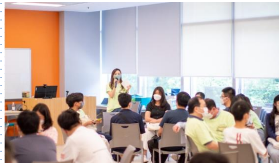
SCM faculty members explained to students of various aspects of their adaption to U-life 教授們耐心講解各項入學注意事項