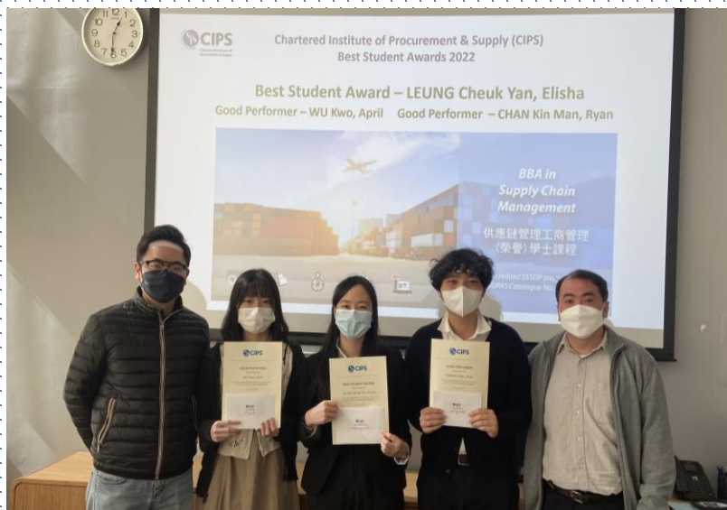
Photos of the winning students with BBA-SCM Programme Director and Associate Programme Director 課程主任及副主任與獲獎同學合照