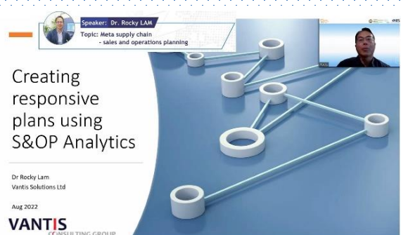
Screenshots during the seminar 研討會期間的屏幕截圖