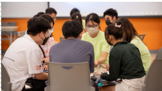
Ice-breaking game between teaching staff and students, which facilitated their interaction and networking