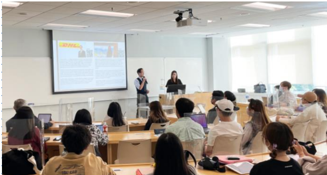
HR representatives of DHL express shared the winning tips when attending a job interview DHL的人力資源管理代表教導學生如何透過自己的履歷表為求職加分

透過一系列的解說和示範，令學生們更能了解自己的專長與喜好，從而以作出適合自己的職業選擇。主講嘉賓除了分享如何按職業的特點作合適自己的選擇，同時亦示範有效的自我介紹令面試官留下好印象，而且還舉例了如何處理在面試過程中常遇到的難題。主講嘉賓的種種分享啟發了學生如何預備日後的事業規劃。