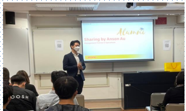
BBA-SCM graduate shared his experience as a management trainee in DHL 畢業生分享他的經驗