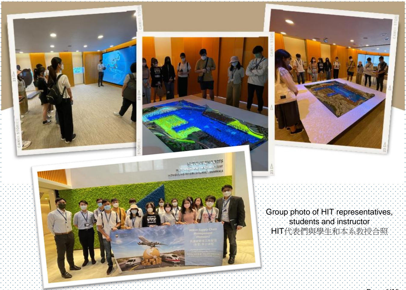
Group photo of HIT representatives, students and instructor HIT代表們與學生和本系教授合照

供應鏈及資訊管理學系分別在2022年10月6日（星期四）、2022年11月17日（星期四）及2022年11月24日（星期四）為學生舉辦了三次參觀香港國際貨櫃碼頭有限公司（HIT）的活動。HIT是和記港口集團的成員之一，擁有全球港口和物流業務網絡。HIT的代表們向同學分享了港口的最新發展情況，並在簡介會之後帶領他們參觀了集裝箱堆場。活動總共有50名本學系同學參加，他們通過活動對供應鏈有更深入的认识。在活動結束時，本系教授向HIT的代表送上紀念品並拍照留念。